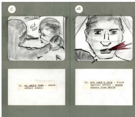
[Detail] Storyboard for RAGING BULL (1980). Martin Scorsese. Pencil and ink on paper. Martin Scorsese Collection, New York.