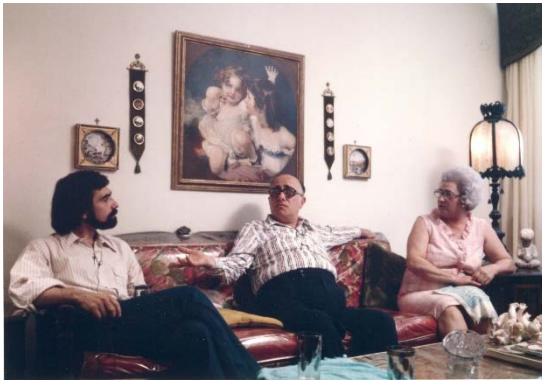
Martin Scorsese and his parents, Charles and Catherine Scorsese, during filming of Italianamerican (1974)

INSTALLATION PHOTOGRAPHS OF THE EXHIBITION ARE AVAILABLE IN THE MUSEUM'S ONLINE PRESS GALLERY: