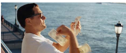
Leonardo DiCaprio in THE WOLF OF WALL STREET (2013).