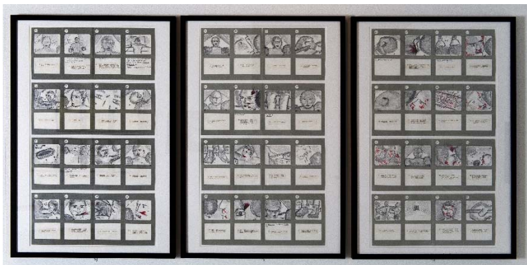
Storyboard for RAGING BULL (1980). Martin Scorsese. Pencil and ink on paper. Martin Scorsese Collection, New York. Installation view at Deutsche Kinemathek - Museum für Film und Fernsehen.