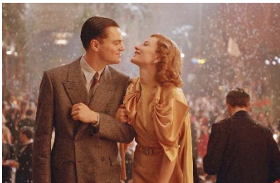
Leonardo DiCaprio and Cate Blanchett in THE AVIATOR (2004, Dir. Martin Scorsese).