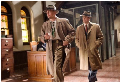
Leonardo DiCaprio and Mark Ruffalo in SHUTTER ISLAND (2010, Dir. Martin Scorsese).