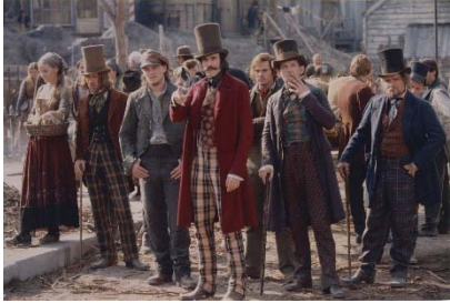
Leonardo DiCaprio (center left) and Daniel Day-Lewis (center right) in GANGS OF NEW YORK (2002, Dir. Martin Scorsese).