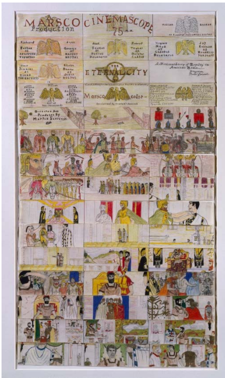
Storyboard for "The Eternal City," an imagined epic film about Ancient Rome, drawn by an eleven-year-old Martin Scorsese. Pencil and crayon on paper. Martin Scorsese Collection, New York.