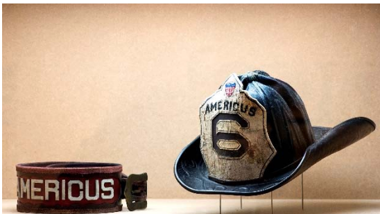
Fireman's helmet and belt, GANGS OF NEW YORK (2002, Dir. Martin Scorsese) Sandy Powell, costume designer. Martin Scorsese Collection, New York. Installation photo from Deutsche Kinemathek - Museum für Film und Fernsehen, Berlin.