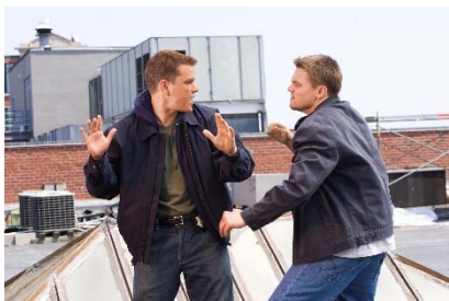
Matt Damon (left) and Leonardo DiCaprio (right) in THE DEPARTED (2006, Dir. Martin Scorsese). A Warner Bros. Pictures' film.