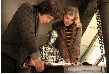
Asa Butterfield and Chloe Grace Moretz in HUGO (2011, Dir. Martin Scorsese).